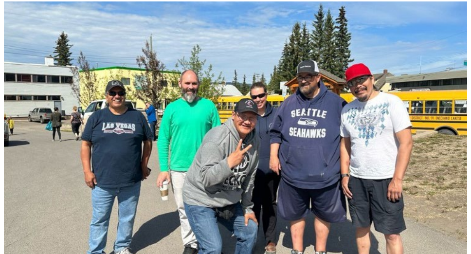
CMCL Advisors and Coordinators at the Burns Lake NIPD event.