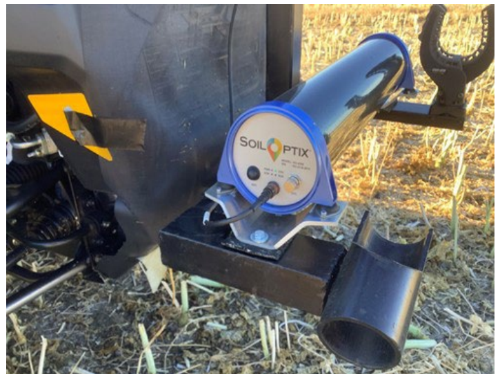
The use of Soil Optix will help prepare the land for a successful growing season.