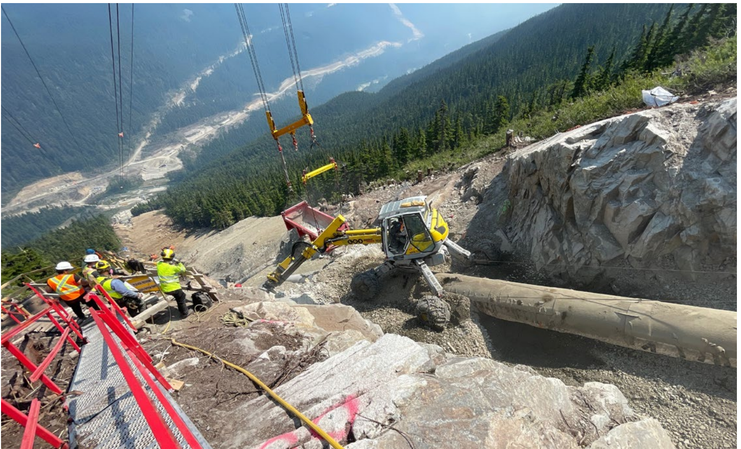
View from Cable Crane Hill, one of the Projects several key special sections, where the dedication and skills of our workforce are taking what we know of pipeline construction to new heights.