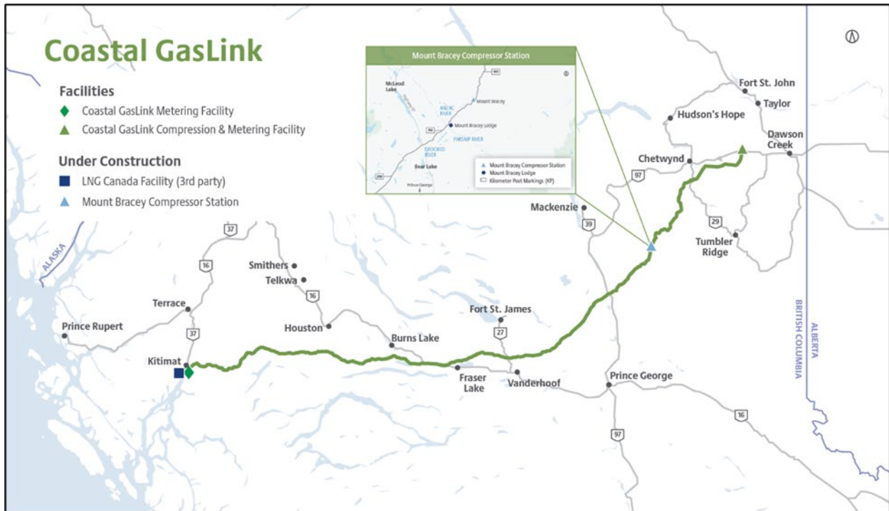
Figure 2-1: Coastal GasLink Pipeline Corridor Map, 2025