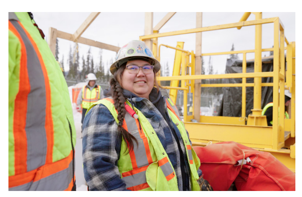
CMCL's like Destiny (pictured above) observe, record and report back to their communities on construction activities.

The CMCL program currently supports more than 45 advisors representing all 20 nations across our project route, fostering an environment of transparency and continued learning.