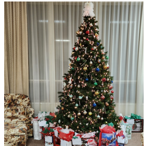
Gifts for residents line the tree at the Silver Birch Lodge.