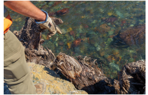
Using root wads from tree stumps provides flow refuge for smaller fish which may not have been available to them before.