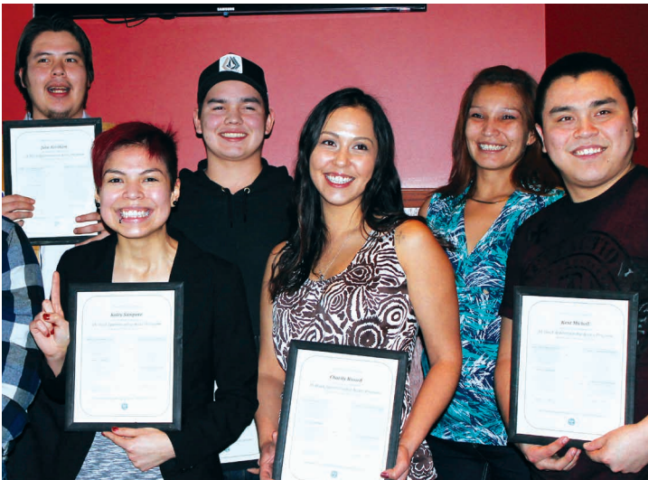
PGNAETA's first Trades Access graduates enjoying their accomplishment.

Here are a few examples of our partnerships that aid in getting students prepared for working on pipeline and other projects.