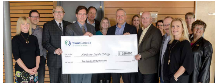
Representatives from Coastal GasLink Pipeline, Prince Rupert Gas Transmission and Northern Lights College