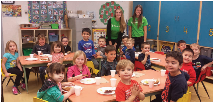
TransCanada launches the Breakfast Club program at Thornhill Primary in Terrace.