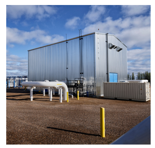
Example of a compressor station

As natural gas flows along a pipeline, it slows due to friction with the pipe, resulting in a drop in pressure. To keep the gas flowing at a required rate, it is re-pressurized at locations along the pipeline. This is done by mechanically compressing the gas at sites connected to the pipeline, known as compressor stations.