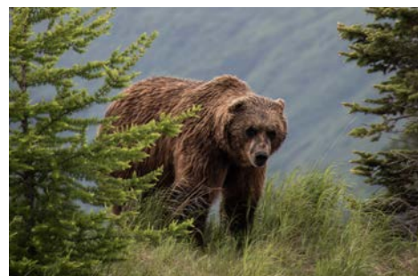
Grizzly bears are an important part of the landscape across northern British Columbia

Environmental responsibility means always doing the right thing. To help reduce our footprint, Coastal GasLink works hard to proactively identify and mitigate potential issues every day.