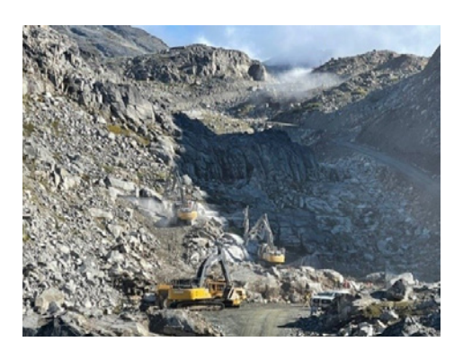
Views of Icy Pass

To house our growing workforce, the Mt. Merrick and P2 Lodges opened — the last two of our twelve workforce