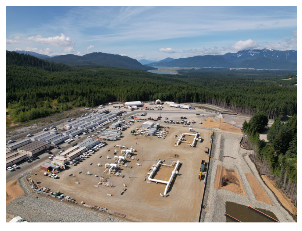
Aerial view of Kitimat Meter Station

accommodations on Coastal GasLink. These accommodations are designed to keep workers safe, while also minimizing potential effects on local community services and infrastructure.