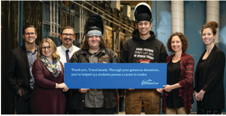
Coastal GasLink provides a $50,000 boost to the Pathway to Pipeline Readiness Trades Bursary (January 2019)