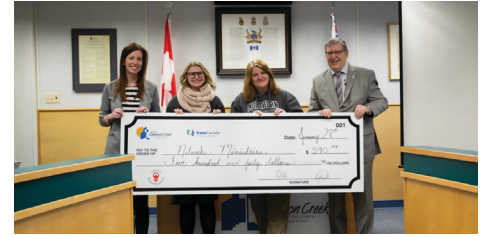
Our team presented a donation to the Kindness Meter Initiative, a partnership between the City of Dawson Creek and Coastal GasLink (January 2019)